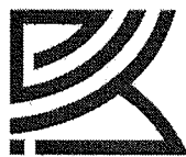
EÖTVÖS KÁROLY POLICY INSTITUTE