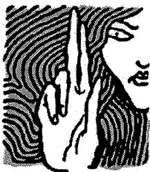
Hungarian Helsinki Committee